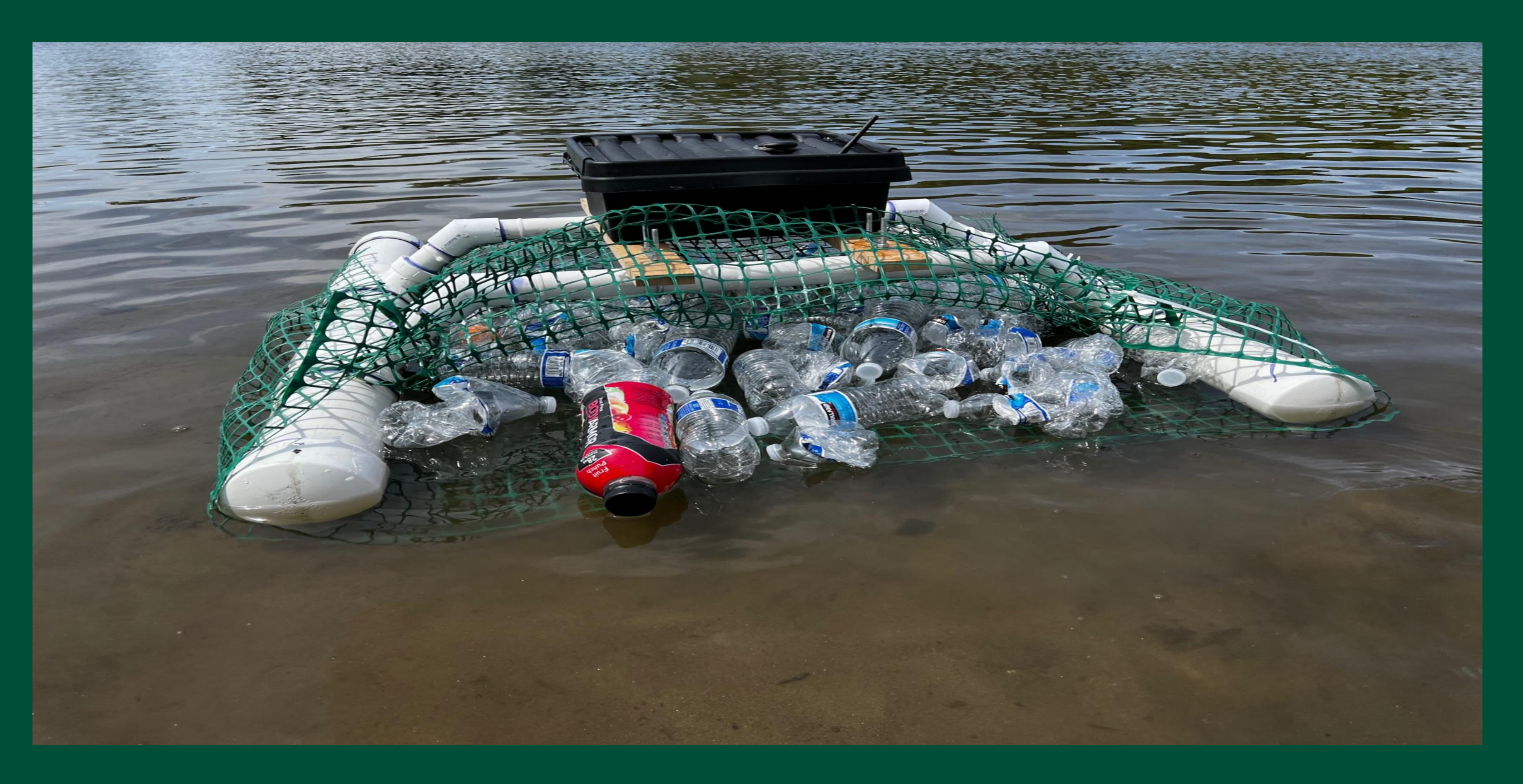
Figure 1: Image of Plastic Collecting Rover

In order to minimize the amount of plastic present in local rivers and lakes, a fully autonomous rover was designed to collect surface-level plastic.